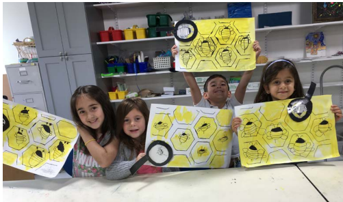
Rosh Hashanah-themed painting in the art room.