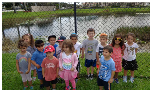
EC-4 students take a short field trip to our pond to perform Tashlich.