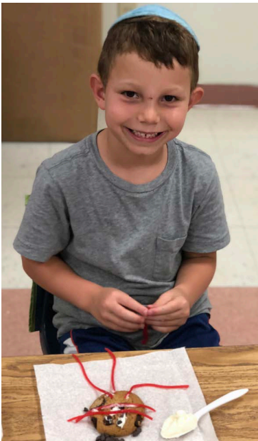
"C" our Cat Cookies! Kindergarten had a blast learning about the letter "C" and creating yummy cookies!