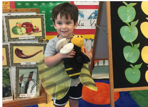
EC-2 students in the Rosalind Henwood Early Childhood Learning Center make apple dishes, honey jars and shofars to get into the spirit of the New Year.