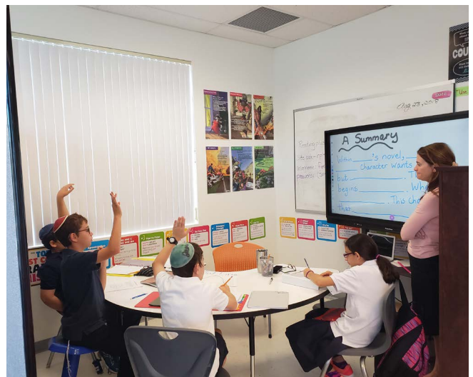
Classes use the new Promethean Boards that were installed over the summer. The boards promote interactive educational technology.