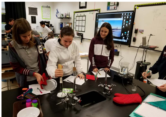
Middle school students conduct experiments in the science lab.