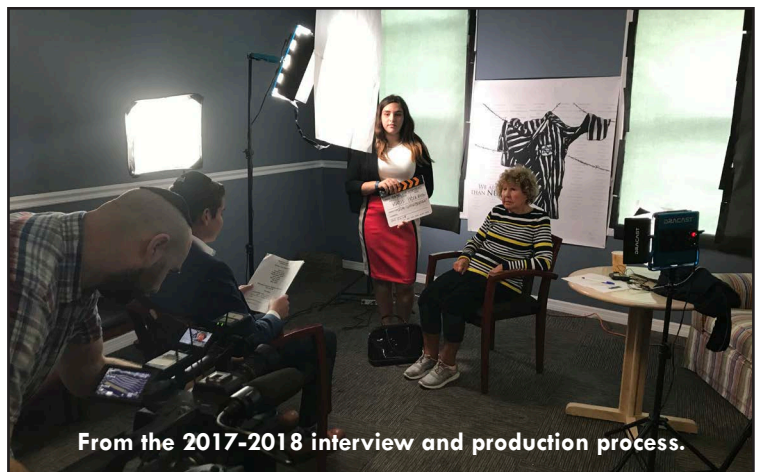
From the 2017-2018 interview and production process.