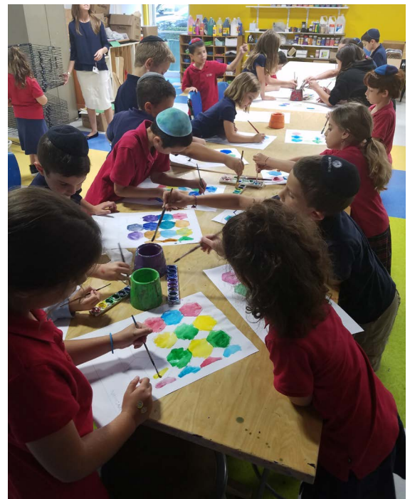
Students get creative in the new art room.