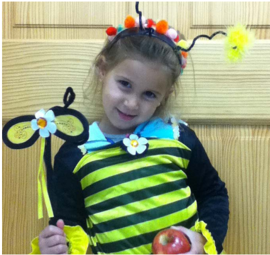
EC-4 is a-buzz for a sweet New Year.