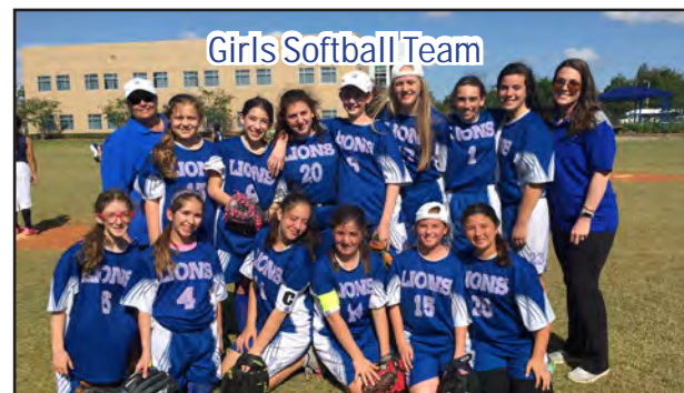
Girls Softball Team

Congratulations to our 4th and 5th grade student athletes, who celebrated the end of an awesome year at our awards celebration on June 5th. Athletes and coaches shared memories of the season and all of our athletes received medals and enjoyed a falafel dinner together. It was a terrific afternoon!