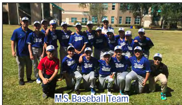
M.S. Baseball Team