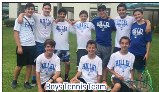
Boys Tennis Team