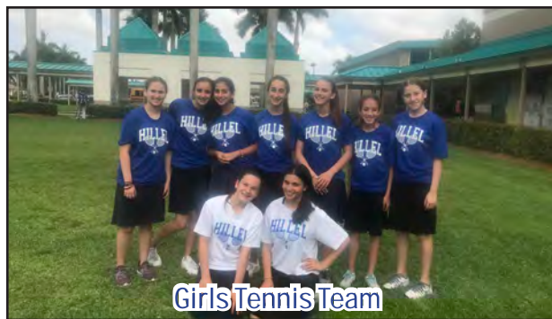
Girls Tennis Team