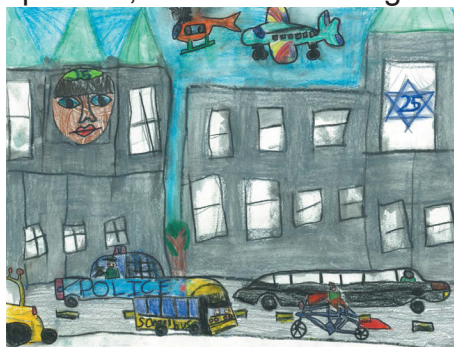
Caleb Berman, 3rd Grade

Each grade had themes to present and each student selected their particular area of interest within their theme. These included our beautiful