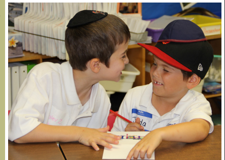
Students in grades 1-5 participated in Chesed Day with other local Jewish Day Schools on December 11, 2013, at the Jewish Federation of South Palm Beach County.

Students in grades 1-5 enjoyed a day filled with fun and informative activities, such as recycling water bottles to create a tree inspired by the artist Dale Chihuly, nature walks, planting a new butterfly garden in our playground, writing nature poetry, learning about compost and then making some yummy edible compost, and much more.