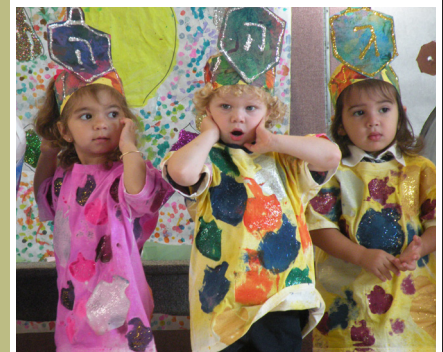
Early Childhood students performed their annual Chanukah program.