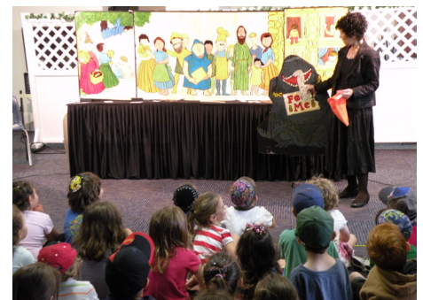
Miss Rita's theatrical storytelling is always an anticipated visit.