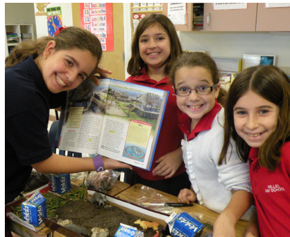
4th graders build tee-pee displays for Thanksgiving.