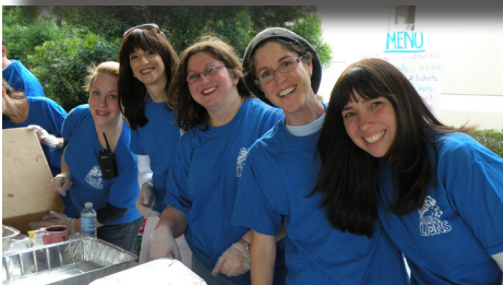
See page 6 for a re-cap of the Chanukah Fair and Open House.

All items in green type are Midot-related.