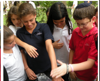
5th grade students learn about the benefits of composting.