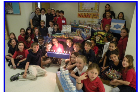
Chanukah display by 3rd graders.