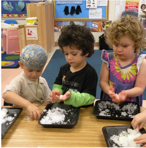
EC3 students create snowballs for their winter theme.