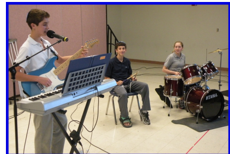
The debut of the 95th Ave. Band rocks the Cafetorium.