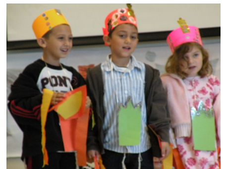
Lower school Chanukah programs.