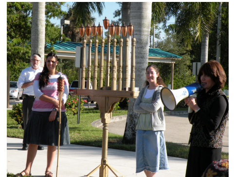
Lighting the menorah each morning during Chanukah.