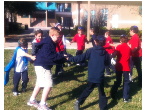
Chanukah fun and ruach.