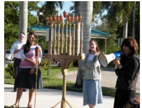
Lighting the menorah each morning during Chanukah.