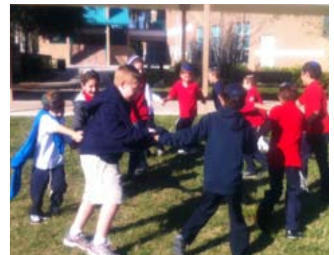
Chanukah fun and ruach.