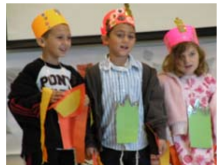
Lower school Chanukah programs.