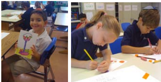
The 2nd graders work on their Rosh Hashanah card designs for the 5772 contest.

from English units to SI units, and take volume readings in graduated cylinders. In addition to becoming familiar with lab equipment, they are also observing lab safety procedures.