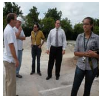
The Jewish Journal interviewed HDS leadership and faculty for a story about the new Middle School building.