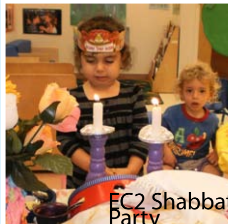
EC2 Shabbat Party

This year's KTP includes many new programs such as rocketry, fitness, magic, Chinese, and much more.