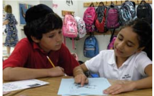
The 1st and 4th graders work together several times during the year sharing in Chavruta learning.