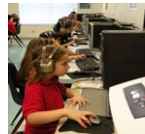
Students get "techy" during computer labs.